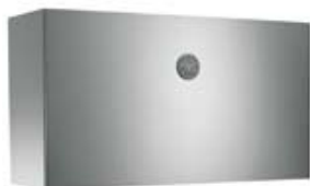
30 Full Width Duct Cover